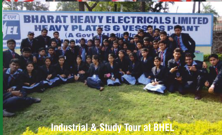
Industrial & Study Tour at BHEL