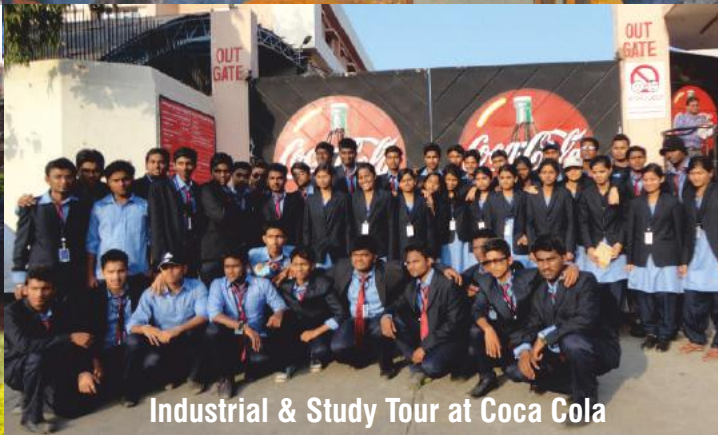
Industrial & Study Tour at Coca Cola