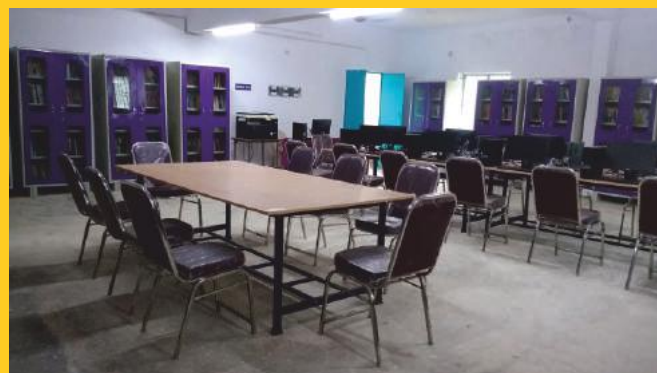
Library with Reading Room