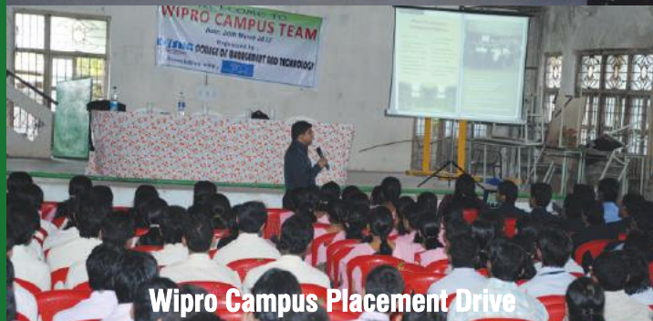
Wipro Campus Placement Drive